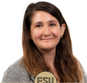
FSU Research Team Receives $500,000 Grant from EPA Program to Revitalize Former Industrial Land

A collaborative, interdisciplinary team with researchers from College of Social Sciences and Public Policy was awarded a $500,000 grant from the Environmental Protection Agency’s Brownfields Revitalization Anti-Displacement Strategies (BRADs) Program.