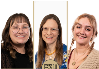
COSSPP Research Team Awarded Borchard Foundation Grant

An FSU College of Social Sciences and Public Policy (COSSPP) research team was awarded a $20,000 grant from the Albert and Elaine Borchard Foundation for the project “Pro-Tech Ageism? Analysis of U.S. Aging Policy’s Depiction of Technology.”